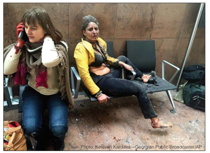
Two women are wounded in a terrorist attack at Brussels Airport in Belgium, March 22, 2016.

(Geneva) — In case you missed it, March 20 was International Happiness Day. As usual, it included a study of the state of international happiness, ranking countries from most to least. This year's top three were Denmark, Switzerland and Iceland. All are peaceful, prosperous democracies, located in the calmest regions of the world. And then, at number 11, comes Israel. Israel's official Bureau of Statistics has also reported that in 2013, 86% of Israelis over the age of nineteen said they were "very satisfied with their lives." (Fox, Mar. 21, 2016)