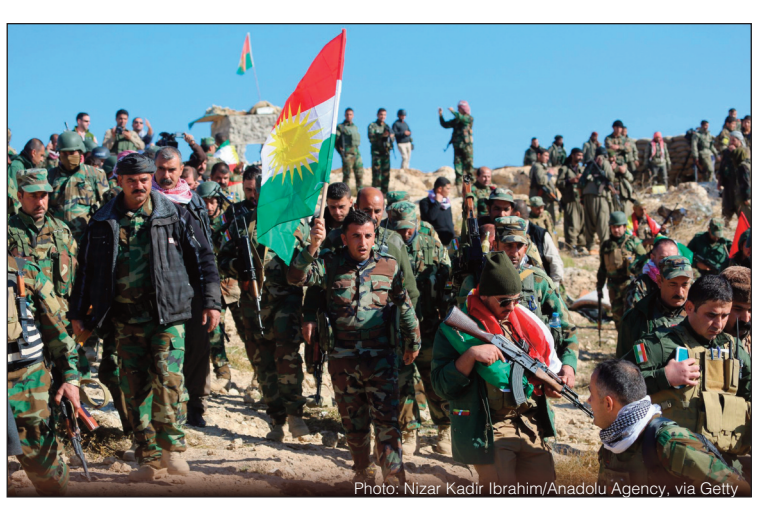
Kurds Retake Sinjar From Islamic State, Nov. 2015

building, 27-year-old Abdelhamid Abaaoud was identified based on skin samples. His body was found in the apartment building targeted in the chaotic and bloody raid in the Paris suburb of Saint-Denis. Police launched the operation after receiving information from tapped phone calls, surveillance and tip-offs suggesting that Abaaoud was holed up there. Killed along with Abaaoud was a woman who blew herself up with an explosives vest at the beginning of the raid. Eight people were arrested. (National Post, Nov. 19, 2015)