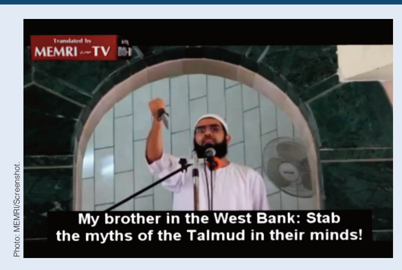
A cleric from Rafah called on Palestinians to stab and murder Jews during his Friday sermon.

and their three young children wounded in a firebombing attack on their car.