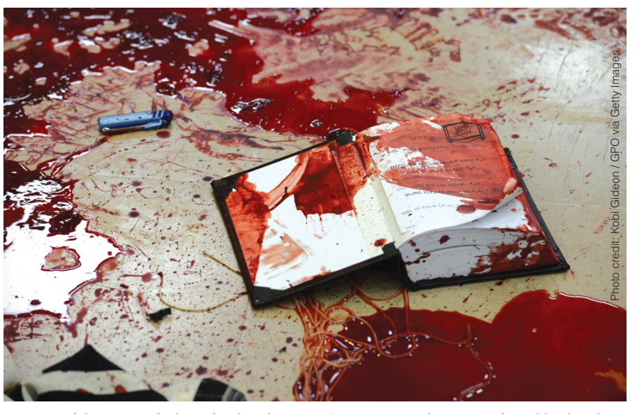
View of the scene of a horrific slaughter at a Synagogue in the Har Nof neighborhood of Jerusalem, November 18, 2014. Two Arabs from East Jerusalem murdered four Rabbis, and critically wounded a responding Druze Israeli police officer who later died of his wounds. The two terrorists were then shot dead by police.

There is no getting around the fact that Islam is becoming more dangerous for everybody. Of course, none of us has the right to deny the sincerity of the individual Muslim as he steps up to respond to the questions of the iournalist-polltaker meeting him at the door of the Mosque and as he insists that the Prophet is really and truly a messenger of peace. That's his story, and he is stuck with it. But our salvation depends on recognizing that it is not and never has been true. Paradoxically, as the Islamist