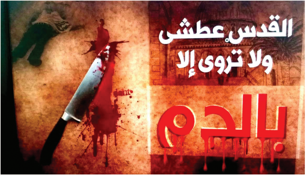
Within hours of the heinous attack on a Jerusalem synagogue on November 18, 2014, Palestinian social media featured images glorifying the bloody slaughter of Jews while they worshipped. The caption in Arabic reads: "Jerusalem is thirsty, and this thirst will be quenched with blood.".

March 14, 2004 —Ashdod: ten killed, sixteen injured in twin suicide bombings (five killed immediately by first explosion, second explosion killed three immediately and fatally