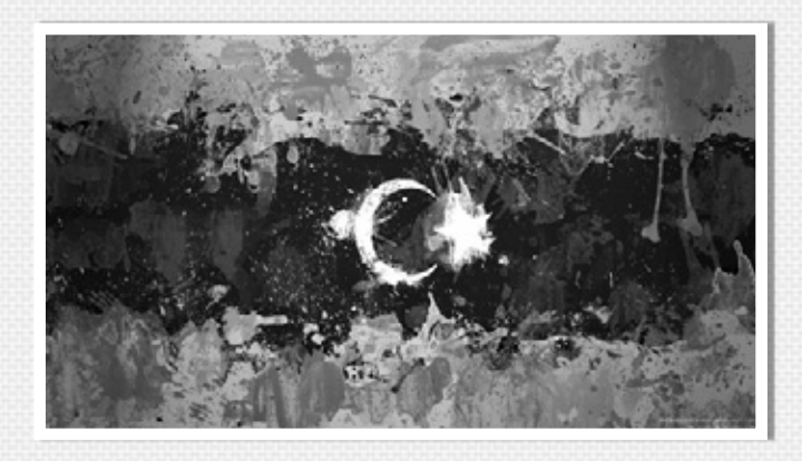
THE REBEL FLAG OF LIBYA WAS FIRST USED BETWEEN 1951-69, UNDER THE LIBYAN MONARCHY.

Chances are that Islamist tribal militias will turn the lives of Libyans into a living hell and plunder the nation's oil resources in order to buy armaments. Allegiances and power-sharing will galvanise around the traditional territorial divisions of Cyrenaica, Tripolitania, and Fezzan. The first two will fight a bitter struggle and the outcome will be decided by the third, as Fezzani peasants and tribes adhere to either one or the other. In contrast to this worst-case—but most likely—scenario, Mohammed El-Senussi, the legitimate heir to the Senussi Crown of Libya, could return and form a constitutional monarchy based on the 1951 Constitution. Support for the Royal Senussi dynasty has traditionally been strong in the region of Cyrenaica, where its main city, Benghazi was the site of the turning point in the war against Gaddafi's forces. In this best of possible worlds, the restoration of the monarchy would provide to the Libyan nation a much-needed sense of historical continuity, prestige and stability. However, as most people know, one can't derive an "ought" from an "is".