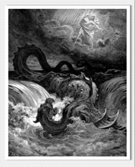
"DESTRUCTION OF LEVIATHAN". 1865 ENGRAVING BY GUSTAVE DORÉ

THE U.S GEOLOGICAL SURVEY ESTIMATES A MEAN OF 1.7 MILLION BARRELS OF RECOVERABLE OIL AND A MEAN OF 122 TRILLION CUBIC FEET OF RECOVERABLE GAS IN THE LEVANTINE BASIN PROVINCE.