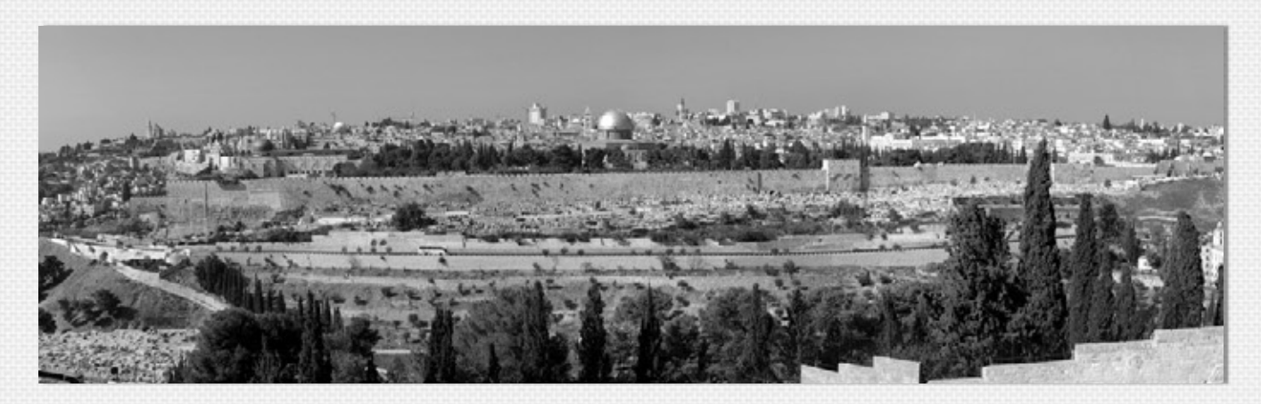
THE TEMPLE MOUNT, WHERE THE FIRST AND THE SECOND JEWISH TEMPLE STOOD, IS ONE OF THE MOST IMPORTANT RELIGIOUS SITES IN THE WORLD. IT HAS BEEN USED AS A RELIGIOUS SITE FOR THOUSANDS OF YEARS.

The attitude held by many churches, that Israel is responsible for hostilities, ignores the serious plight of Christians living under Muslim rule.