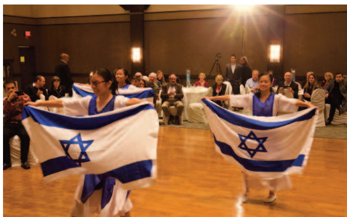
Pro-Israel Filipino church group "Friends of Jesus Christ"