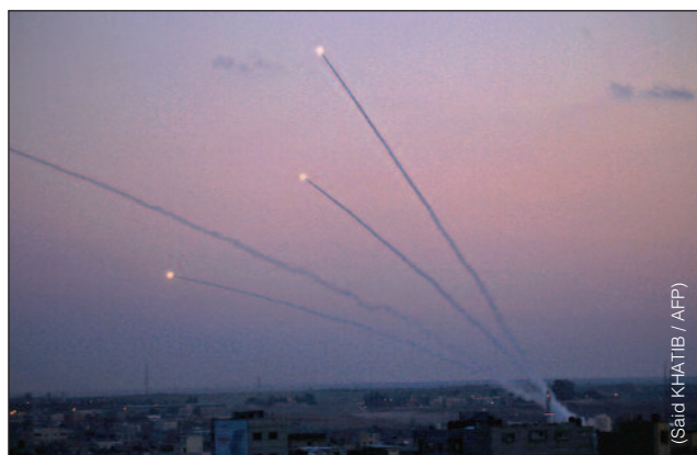
Hamas missiles launched toward Israel from Gaza on November 12, 2018