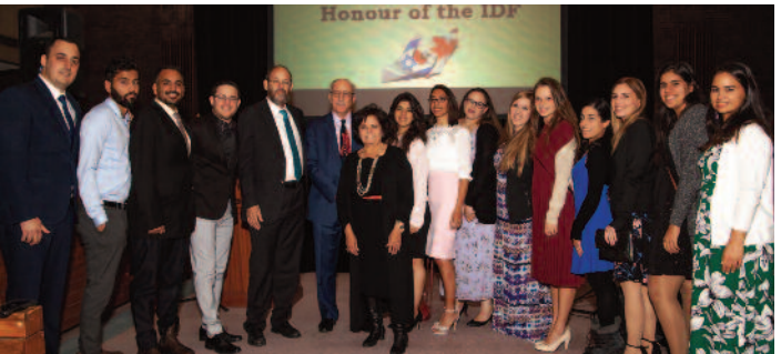
Generations of Israel Group