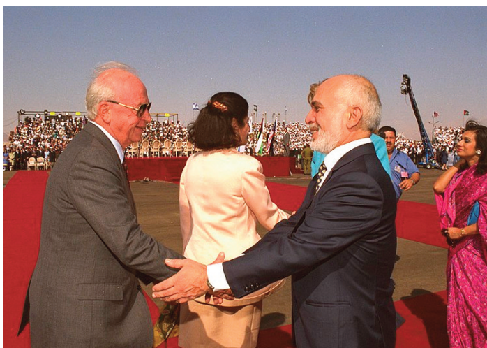
Israeli Prime Minister Yitzhak Rabin and Jordan's King Hussein greet each other at the Arava Border Terminal prior to the signing of the peace treaty between their countries on October 26, 1994.

A coalition of Arab states led by Egypt and Syria, launched a co-ordinated attack against Israeli forces in the occupied Sinai and Golan Heights on Yom Kippur, the holiest day in Judaism. Israel ultimately prevailed, almost reaching Damascus and Cairo, but only after suffering significant losses.