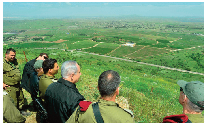
Prime Minister Netanyahu and military commanders on Israel's northern border in the Golan Heights

Yet, this extraordinary little country has just been named the third most innovative in the world by the World Economic Forum. The others are all democracies that have known war 70 years ago, often succumbing to evil. How did Israel innovate despite the fact that it is a democracy at war since its creation? Brain, grit and the prospect of the imminent destruction. In the air of Israel one breathes a kind