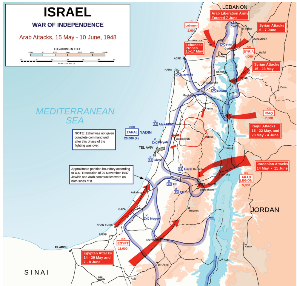
Map depicting military operations from 15th May 1948 to 10th June 1948 during Israeli War of Independence. Symbols used in the map are NATO military symbols.

was a nationalist uprising by Palestinian Arabs in Mandatory Palestine against British Administration, and demanding Arab independence and the end of Jewish immigration as authorized by the League of Nations in 1922. Mohammed Amin al-Husseini, the Grand Mufti of Jerusalem, who encouraged violence against Jews and British authorities, initiated the revolt.