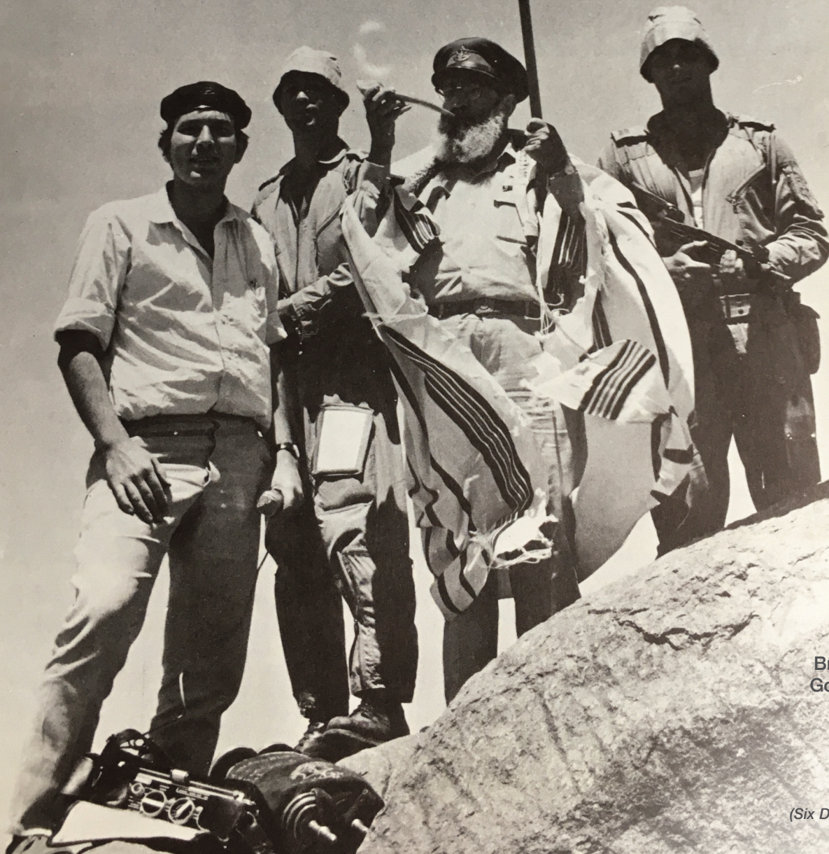
Brig.-General Shlomo Goren, Chief Chaplain of Zahal, sounds shofar on Mt. Sinai crest. With him are two helicopter fliers and a reporter.

Source: The Six-Day War. Tel Aviv: M. Mizrahi Publishing (1967). Photographer unknown