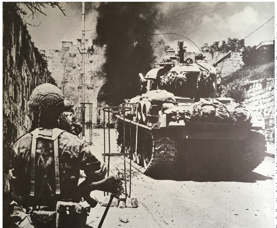
On June 7th, 1967, the walls of the Old City of Jerusalem were breached, and Israel's fighters poured through to take possession of Temple Mount.