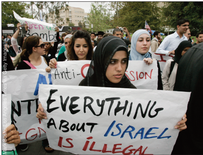
Muslim students at an anti-Israel protest at the University of California, Irvine in 2006.