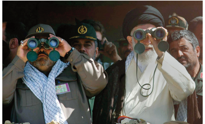
Supreme Leader Ayatollah Ali Khamenei (right) and former head of the Iranian military Hasan Firoz Abadi in 2004.

Israel may have to make more such strikes in Syria because Iran isn't likely to give up on this strategic opening. Iran's Revolutionary Guards know they have Russia's backing in Syria, and the U.S. is signaling that it is loathe to do anything to change that once ISIS is routed from Raqqa. "As far as Syria is concerned, we have very little to do with Syria other than killing ISIS," President Trump