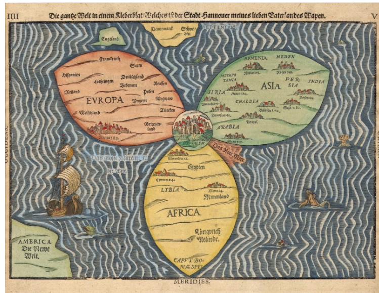
The World in a Cloverleaf , Heinrich Bünting (1581)

ISRAEL'S CONTRIBUTIONS TO WESTERN SOCIETY