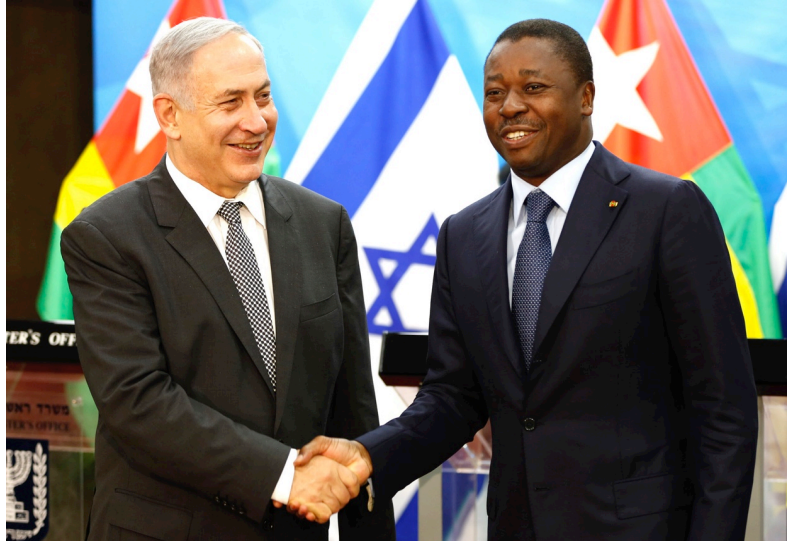
Le premier ministre israélien Binyamin Netanyahu avec le président togolais, Faure Gnassingbé.

À l'été 2016, le Premier ministre israélien, Benyamin Netanyahu, a fait une tournée en Afrique de l'Est. Une seconde tournée dans le continent a eu lieu en juin dernier, alors qu'il fut le premier dirigeant non-africain invité à participer au sommet des pays de la Communauté économique des États d'Afrique de l'Ouest (CEDEAO), qui s'est tenu à Monrovia, au Libéria. Un sommet Israël-Afrique doit également avoir lieu à Lomé, au Togo, en octobre prochain.